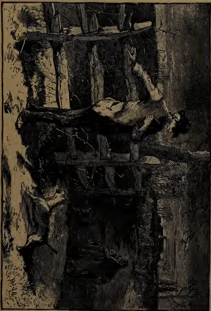
“THE DOGS HOWL CURSES AT ME, AND HUNT ME DOWN THE ROAD.”